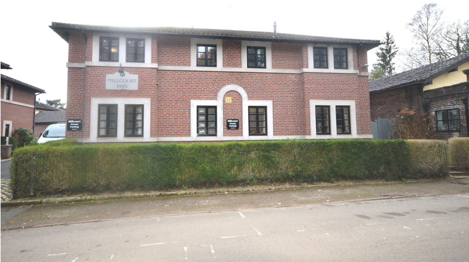
Mill Court Park Drive